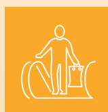
Commercial & Retail