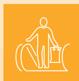
Commercial & Retail