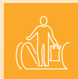
Commercial & Retail